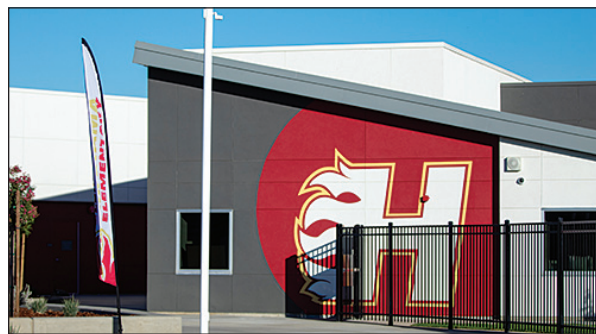
Clovis Unified opened its 35th elementary school this year with students arriving on the campus of Hirayama Elementary, located near Fowler and McKinley avenues in the southeast portion of the district. Photo backdrop stations were a popular stop with parents dropping off their children.